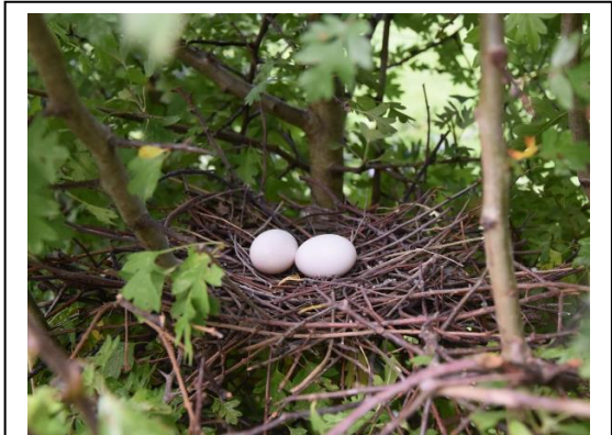
Rough circle of stacked sticks in a tree or hedge.